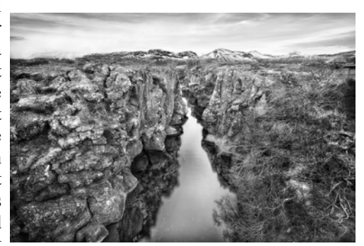
Visible Fault Lines in Thingvellir

the continental plates rear in sheer walls above steaming plain. It is the site of the world's oldest parliament, the Althing. Here, in 930 AD, ancient Icelanders gathered to hold court and elect their parliament. Irish monks were