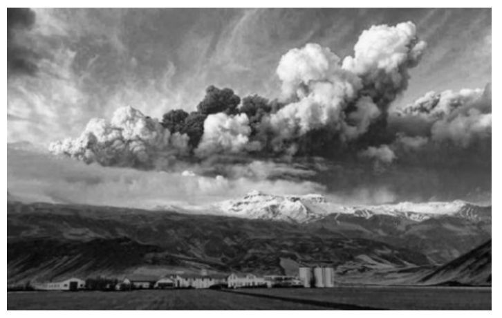
Volcanic Ash from Eyjafjallajokull

Iceland loomed large last year, not so much as a destination more a roadblock. Eyjafjallajokull sent a pall of ash over the North Atlantic disrupting flight services all over Europe. It's not the first